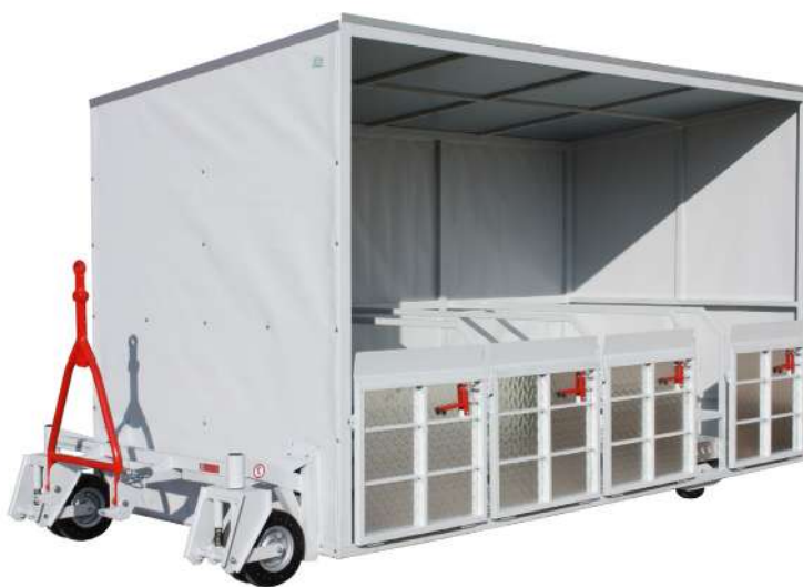
With front suspension