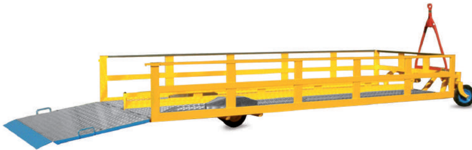
For shopping trolleys